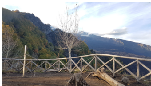
Bove valley from Monte pomiciaro