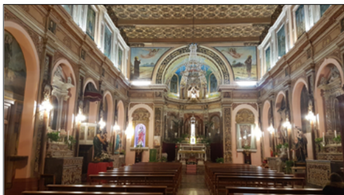
Duomo di Casalvecchio Siculo