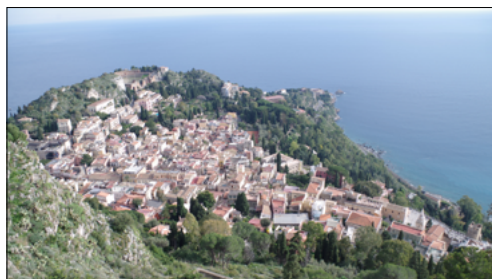
Overview on Taormina from Madonna della Rocca

The routes have been verified with google maps. We do not guarantee the route with Tom Tom, garmin or other navigators who do not rely on the google network.