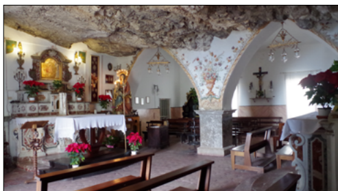
Madonna della Rocca Church