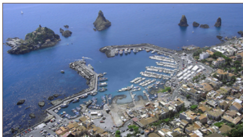
Acitrezza, harbor and parking

From the B&B set "Parcheggio, Via Gibuti, 17, 95021 Aci Castello CT" (via A18 and SS114 orientale sicula 43 min). With this setting you reach the harbor of Acitrezza along the coast from where you can admire the large volcanic islands in the Mediterranean Sea. Arrived at the car park, you decide whether to stay a few hours in Acitrezza, where you can enjoy excellent desserts or a cappuccino or a granita, or continue the tour. From the Acitrezza car park set "Castello Normanno-Svevo di Aci Castello, Piazza Castello, 95021 Aci Castello CT" (via provinciale 6min). On the way put "Parcheggio, Aci Castello, Catania" . Park and walk to the Castle, this large black fortress overlooking the sea. After the visit before you go set "Parcheggio Borsellino AMTS, Via Cardinale Dusmet, Catania CT" (via SS114 orientale sicula 21min). The parking is near the Uzeda Gate from where begin the via Etna the most importante street of Catania where you could reach every importante place of Catania. The tour could take you 2-4 hours. Set the B&B Villa Valentina Taormina from the parking lot and return to the base. Choose via A18/E45 about 41min (depending on traffic).