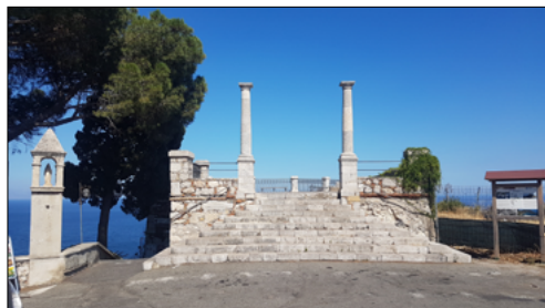
Piazzetta del Belvedere