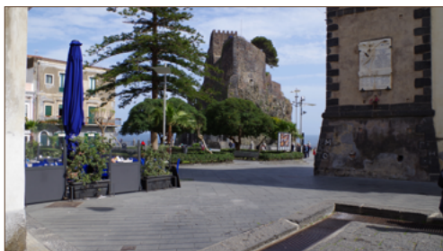
Square of Acicastello