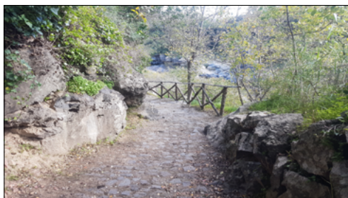
Gurne Alcantara Francavilla di Sicilia

The routes have been verified with google maps. We do not guarantee the route with Tom Tom, garmin or other navigators who do not rely on the google network.