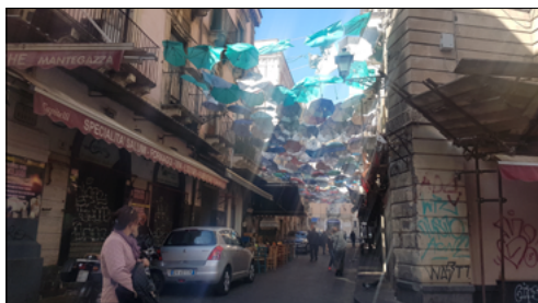
Street of Catania

The routes have been verified with google maps. We do not guarantee the route with Tom Tom, garmin or other navigators who do not rely on the google network.