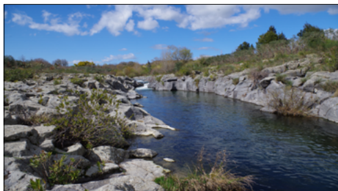
Gurne Alcantara Castiglione di Sicilia