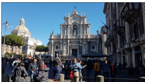
Cathedral of Sant Agata

From the B&B set “ Parceggio Borsellino AMTS, Via Cardinale Dusmet, Catania CT ” (via A18 46min) to the start of Via Etnea near the Uzeda door from where you can start your tour of Catania covering the 2 to 4 can take hours. Set the B&B Villa Valentina Taormina from the parking for return to the base. Choose via A18 / E45 approx. 41min (depending on traffic.)