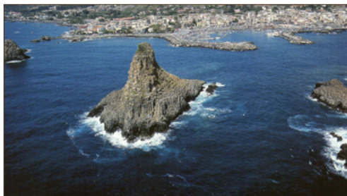
In front of Acitrezza seafront