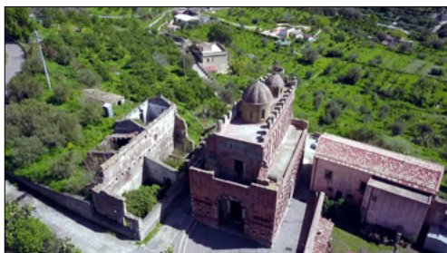
San Pietro e Paolo d'Agrò