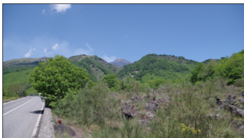
Road to Etna