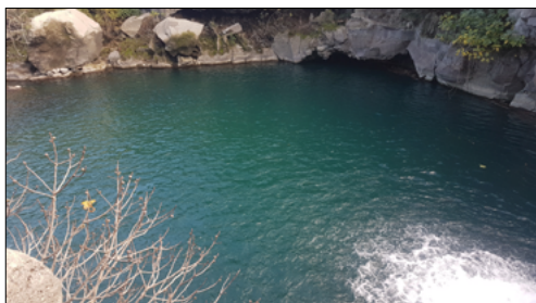
Gurne Alcantara Francavilla di Sicilia